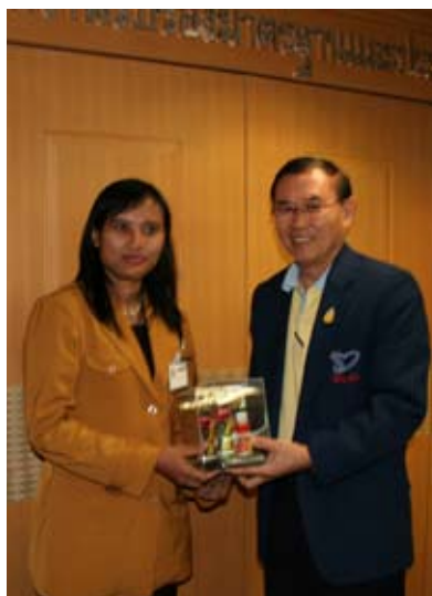
Presentation of ONESQA gift

of the Unit at this time are the implications for universities arising from a stronger evaluative approach to academic audit that is being developed for the non-university tertiary institutions by the New Zealand Qualifications Authority under commission from the Tertiary Education Commission. This development is part of the