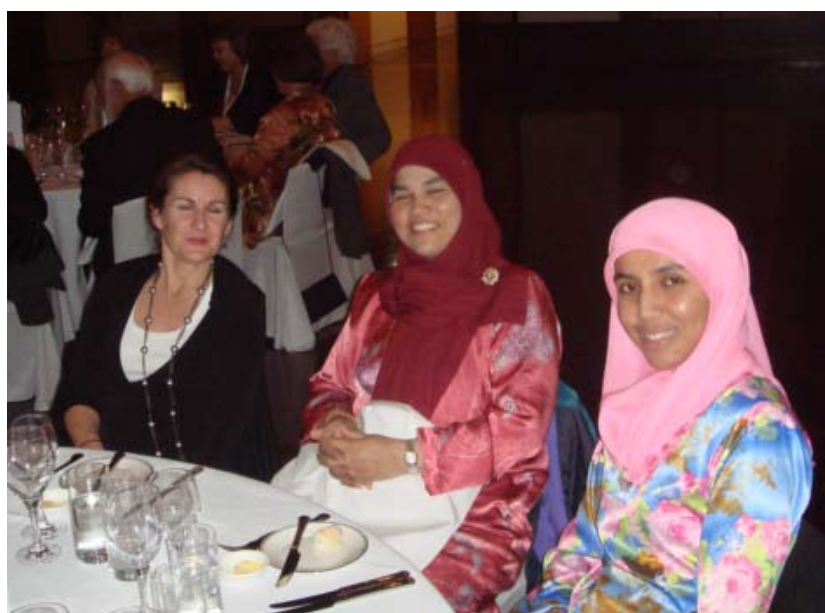
Delegates from BDNAC at the AUQF dinner at Parliament House, Canberra

The Mongolian National Council for Education Accreditation is celebrating its 10th anniversary on the 3 November 2008.