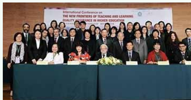
The Opening of the International Conference on The New Frontiers of Teaching and Learning Quality Assurance in Higher Education

This is the first time for APQN to officially publish AAC papers. Both the immediate past president and the current president promise that APQN will try its effort to establish an international platform for the participants from the whole world to share QA vision and commitment for fostering partnership beyond borders.