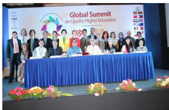
Global leaders in Higher Education Quality Assurance during adoption of Bengaluru Statement 2016 on Next - Generation Quality Assurance of Higher Education at Global Summit organized by NAAC at Bengaluru in presence of Dr. Mahendra Nath Pandey, Hon'ble Minister of State (HE), MHRD, Govt. of India.

Bengaluru Statement – 2016 called upon quality assurance networks, organizations and stakeholders of higher education to join hands and commit to work together to enhance quality in higher education in service of students and society.