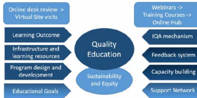
Figure 4 the essential elements required for quality education