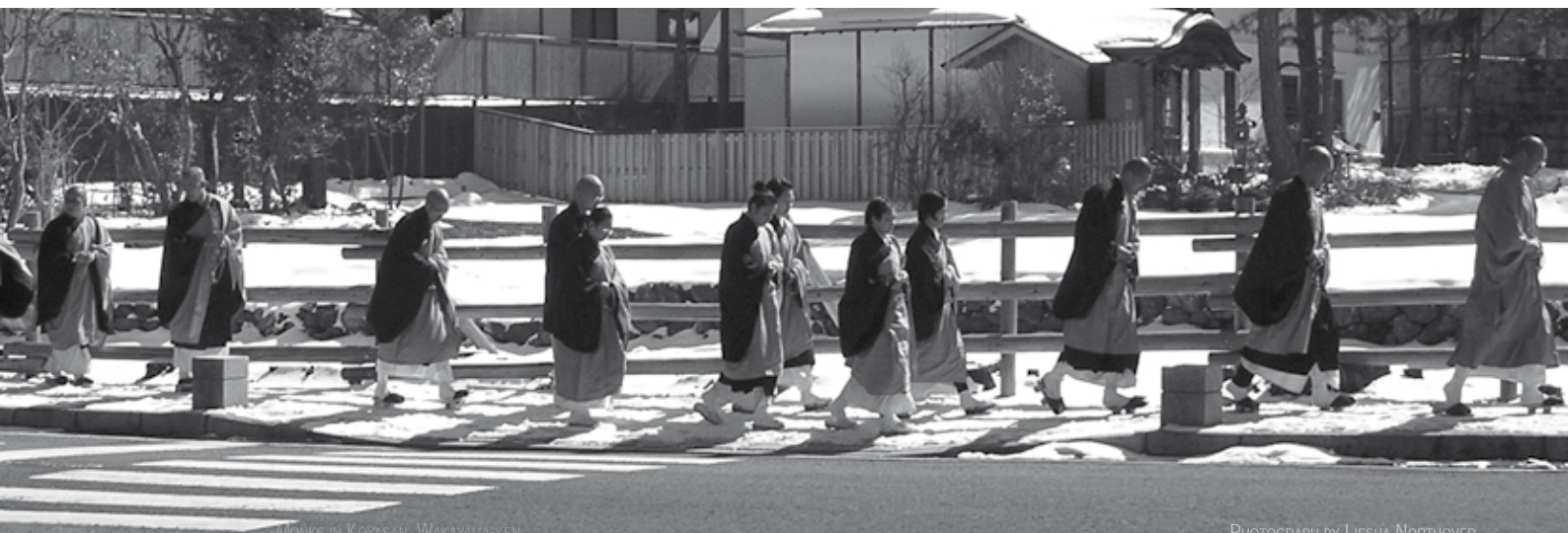
MONKS IN KOYASAN, WAKAYAMA-KEN

APQN listed in the ‘World Directory of Associations in Higher Education’, which is led by the Academic Co-operation Association (ACA) and supported by the Asia-Europe Foundation (ASEF), under its ‘ASEM Education Hub’ programme.