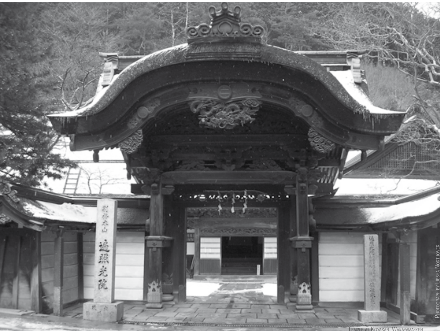
TEMPLE AT KOYASAN, WAKAYAMA-KEN

A call for expressions of interest to host the 2010 event was sent to members on 1 April 2008. Thailand will host the event through the collaborative efforts of The Office for National Education Standards and Quality Assessment (ONESQA), the Commission on Higher Education (CHE), and SEAMEO RIHED. Conference planning and preparation will be managed by ONESQA. The date has yet to be confirmed, but it is expected to take place in early March 2009.